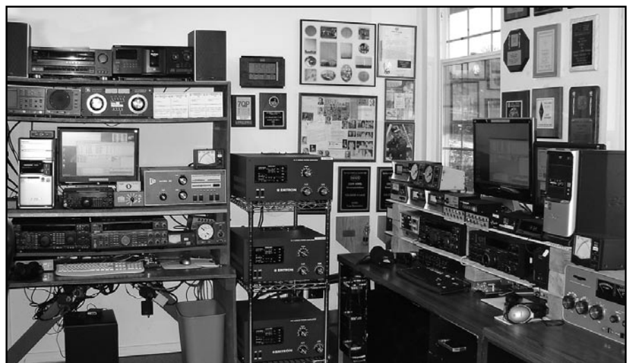
Figure 1—Before: The Phase I station configuration before the 2007 CQ WW CW Contest